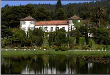
Pazo do Tambre

Day 4 - From Santo Estevo , we head west into the heart of Galicia with the morning's four regularities taking us through some wild and rugged landscapes, reminiscent of western Ireland. After which, we stop for lunch at the Pazo do Tambre - an elegant country villa nestling on the shores of a tranquil estuary.