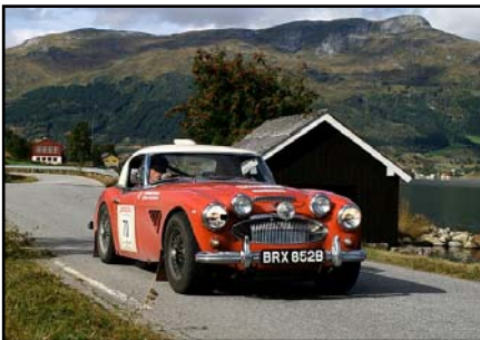
Classic Marathon Motoring

Following a terrific test at a small driver training centre, we ascend into the Asturian mountains en-route to lunch in the lovely little village of Taramundi.